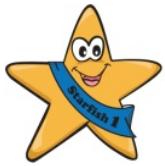
Starfish 1 6-30 months