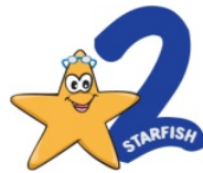
Starfish 2 12-30 months